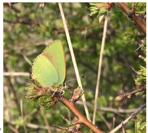
Green Hairstreak butterfly