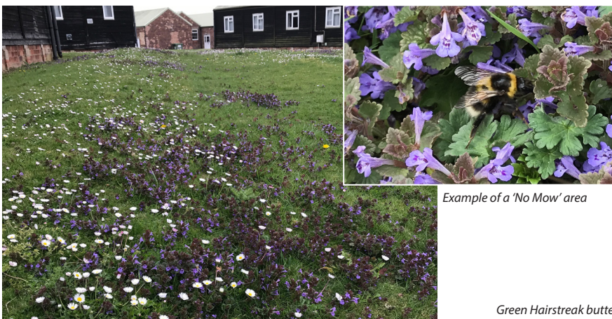
Example of a 'No Mow' area

Plantlife is urging Britain's lawn lovers to leave their mowers in the shed for May and let their grass grow. Our famous green lawns will transform into an urban patchwork of mini meadows of daisies, dandelions and buttercups buzzing with nature. On the 25th-27th May the charity will hold a national Bank Holiday Weekend count, inviting everyone to count the flowers in a random square in their lawn https://www.plantlife.org.uk/uk/about-us/news/plantlife-launches-no-mow-may