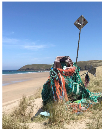
The ever changing sculpture from beach waste at Penhale. The guardian!

• Yardley Chase Conservation Group are holding a wildlife recording event at Yardley Chase Training Area, Northamptonshire, in July 2019. There will be a series of activities going on and visitors can join in with those or under-take their own recording activities. The mix of people that are expected to get involved are wildlife enthusiasts/experts, alongside university students engaged in a range of environmental or ecological studies. It is expected that visitors will contribute to the knowledge of the site. Recording wildlife will be a central theme, but there will be plenty going on and people can join in with whatever they find interesting.